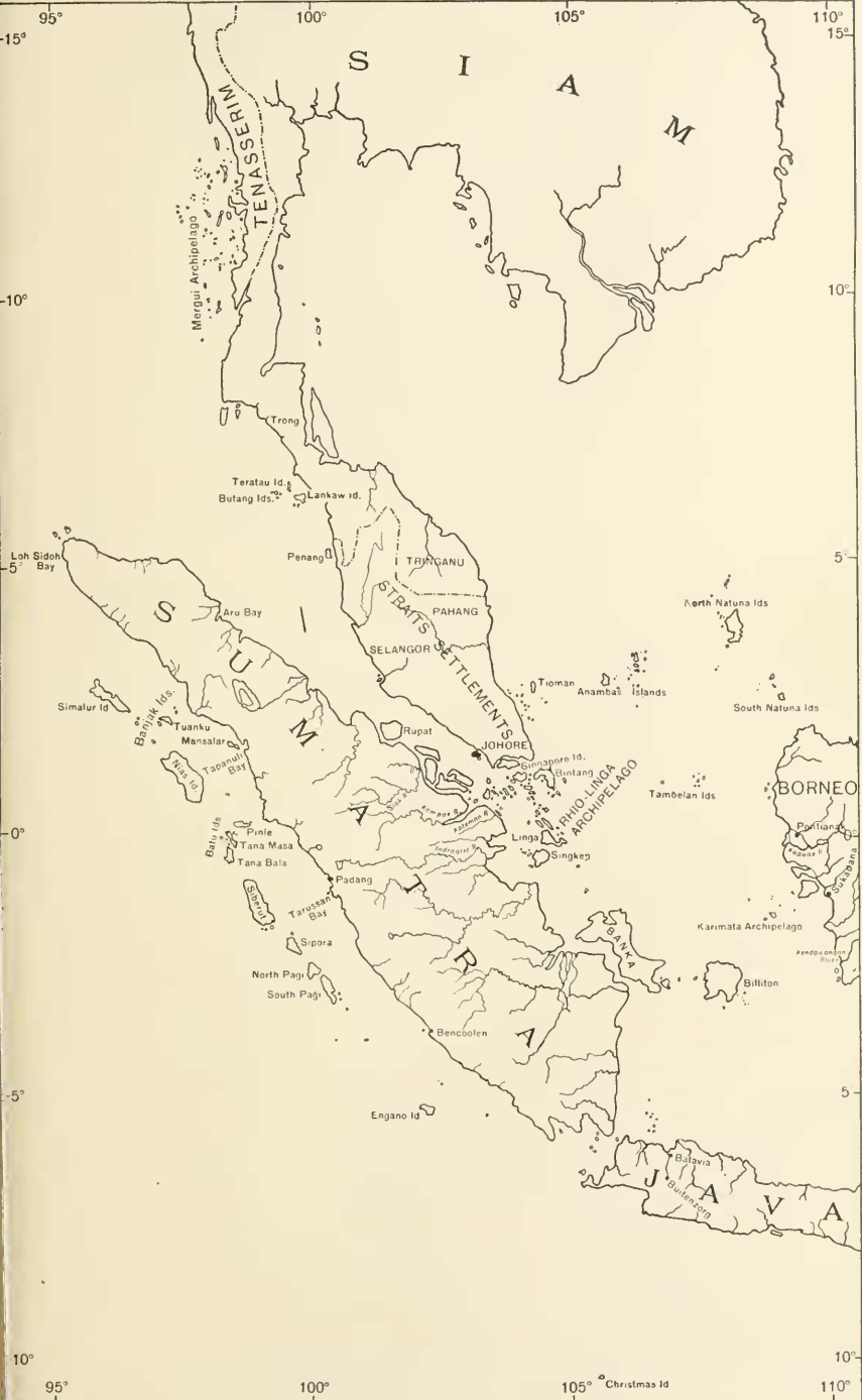
FIG. 2.—MAP OF A PART OF THE MALAY REGION SHOWING RELATIVE SIZE OF RHIO-LINGA ARCHIPELAGO.